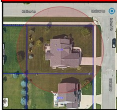
Oversized to Cover Entire Address