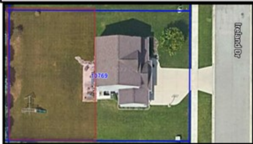
Precisely Drawn to Cover Back Yard