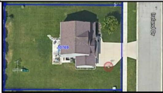
Precisely Drawn for Work around Hoop